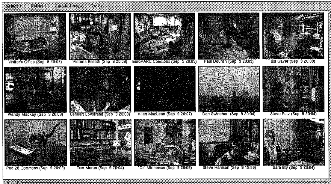
FIGURE 1. A window dump of the "pvc" client to Portholes. The first eight images show EuroPARC nodes; the last seven show PARC nodes. All images were taken at approximately the same time.

could explore the utility of awareness for truly distributed groups without large investment in a technological infrastructure 1 .